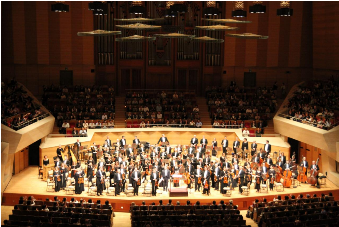
OSM – Tokyo, Suntory Hall, October 16, 2014

October 10 to 22, 2014 – The Orchestre symphonique de Montréal under the direction of Kent Nagano carried out a memorable tour, one in which Japanese audiences rediscovered “its” OSM for the tenth time and Chinese audiences discovered the Orchestra’s distinctive sound for the very first. Throughout its travels – whether in Tokyo’s mythic Suntory Hall, where the world’s finest orchestras perform, or at an unforgettable concert in the outstanding acoustics of Kitara in Sapporo, or as part of the prestigious China Shanghai International Arts Festival, where the OSM was making a first appearance – the Orchestra was welcomed by enthralled and enthusiastic audiences. The tour, the 43rd for the OSM, consisted of nine concerts presented in eight cities in Japan and China.